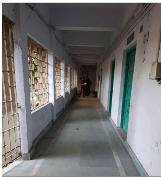
Barrier free corridor ways