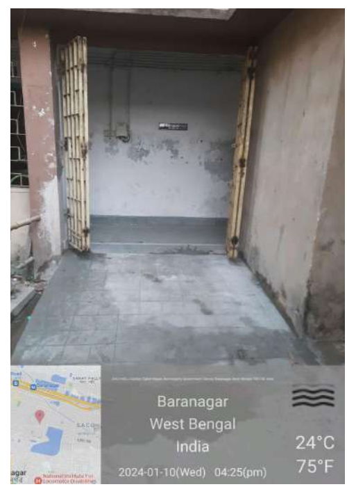
Ramp in the entrance and exit gate of main building