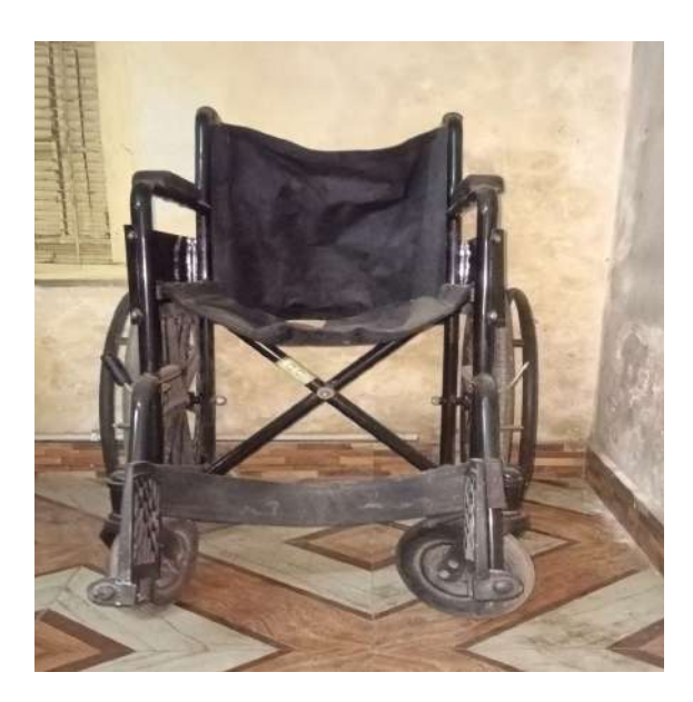
Wheelchair for divyangjan