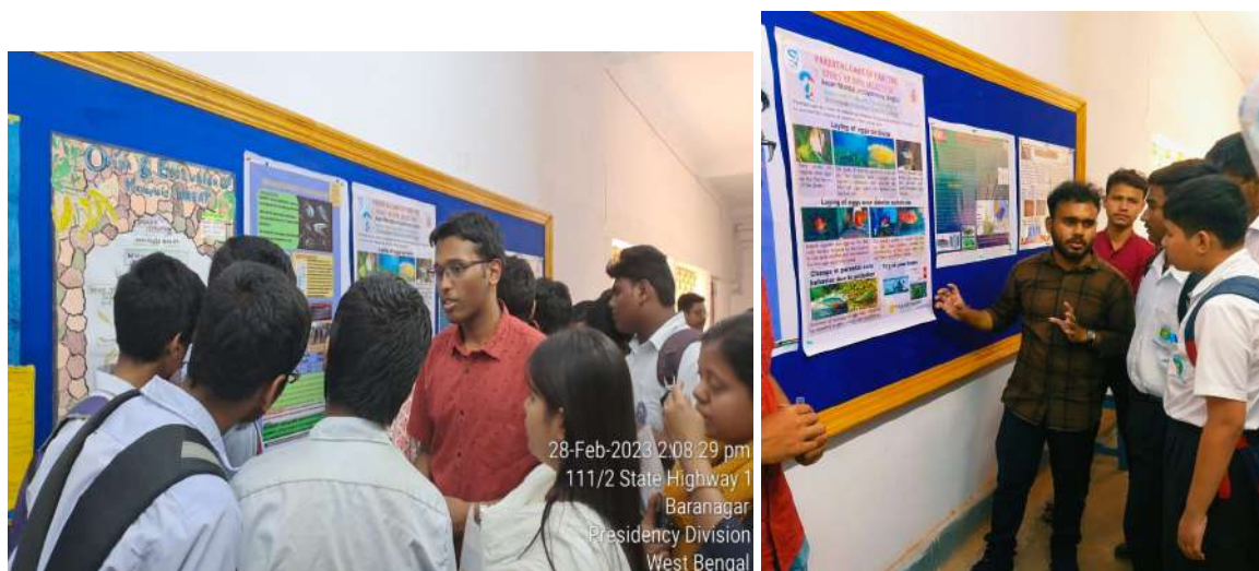
Scientific posters prepared by our students were also displayed and demonstrated in front of the school students and teachers