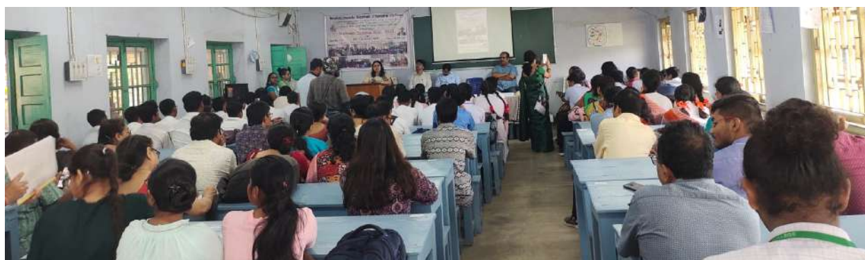
Our Respected Principal Madam delivered her inaugural lecture