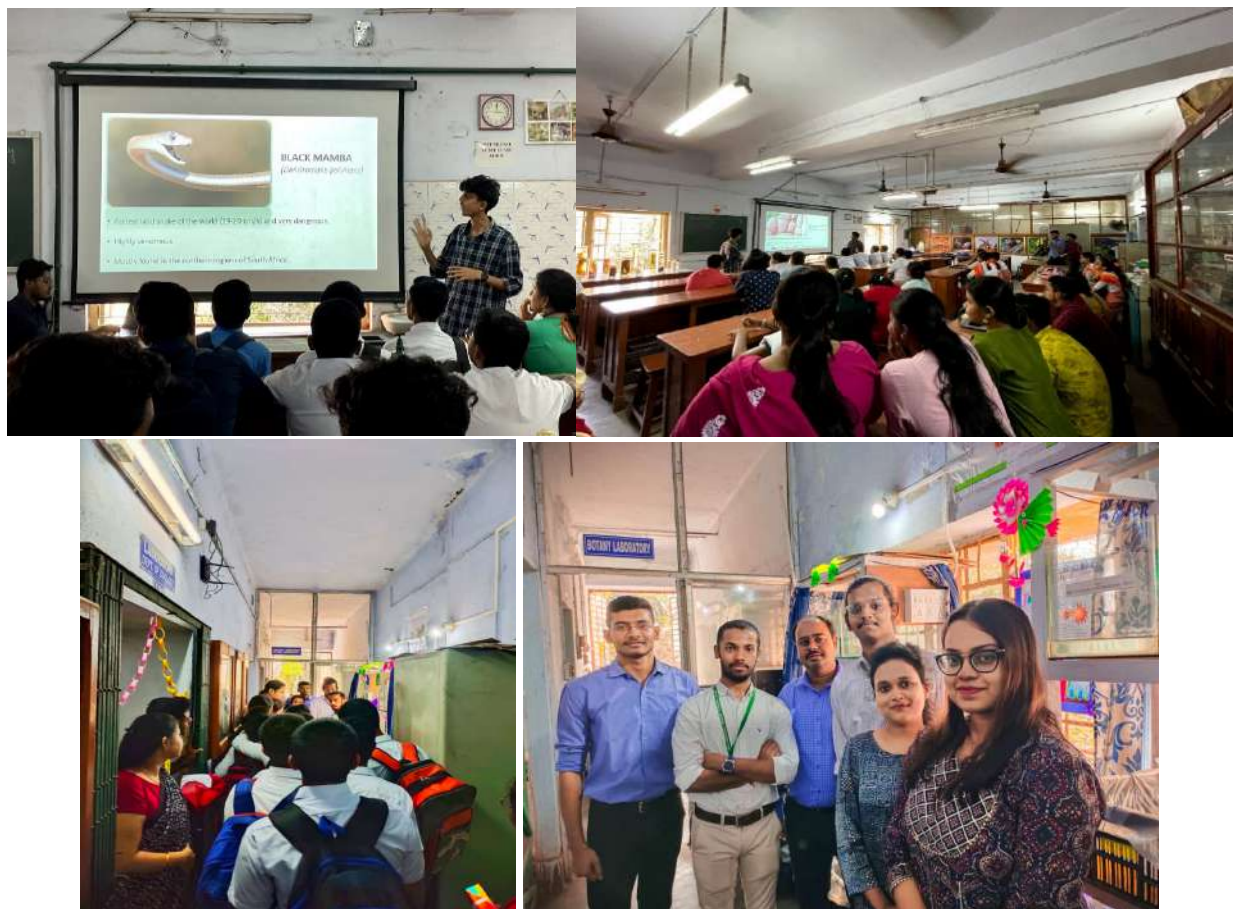
Students from different Science Departments demonstrated the practical based informations to the invited schools stuentns