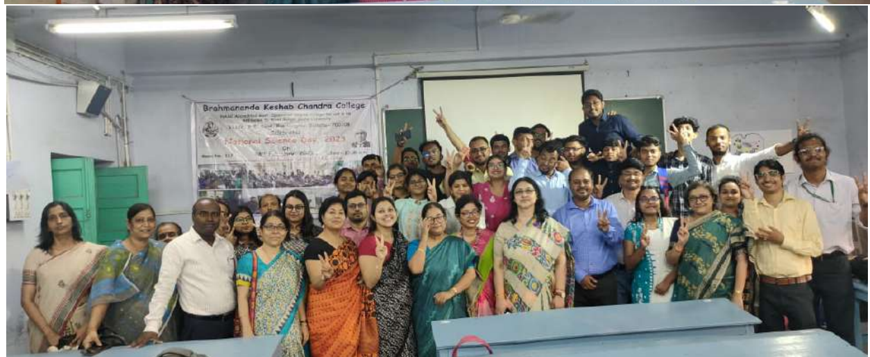
The full team of B.K.C. College to celebrate National Science Day, 2023