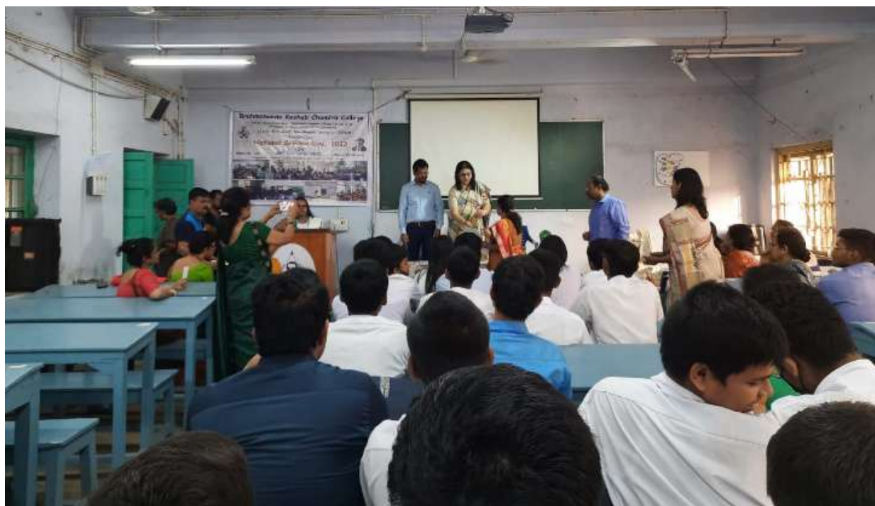
A token of appreciation to our Respected Principal Madam