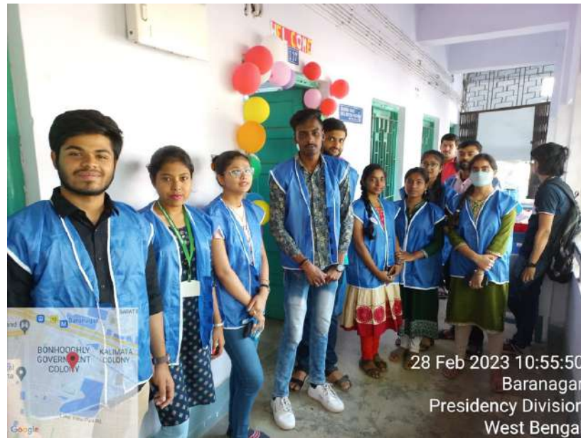
NSS volunteers of our college were actively participated at this programme