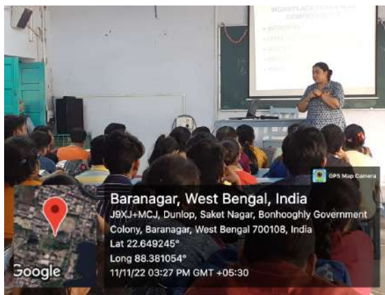
Pictures of Valedictory Session. Facilitators introducing the students to the course